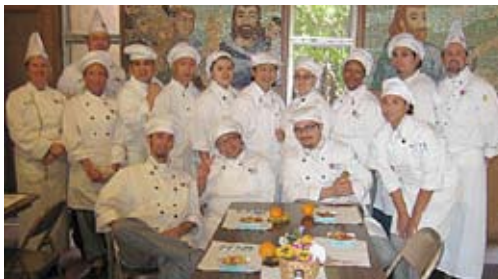
The International Culinary School at the Art Institute of California - Sunnyvale will once again prepare a delicious anniversary meal for ODB volunteers.

menu planned by The International Culinary School at The Art Institute of California – Sunnyvale includes a spring salad and spring vegetables along with a stuffed chicken breast, potatoes, and a scrumptious selection of deserts from the school's bakers. Plan to sit down for dinner around 6:15 and join together as we honor the many ways you and others have made ODB a success.