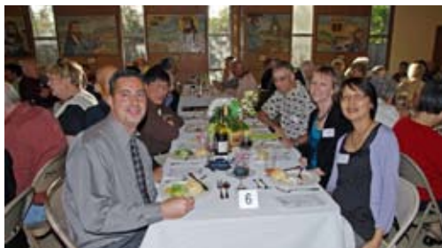
The International Culinary School at the Art Institute of California - Sunnyvale will once again prepare a delicious anniversary meal for ODB volunteers.

This year's entertainment will be more refined as we are serenaded by a classical trio, starting at 5:15 p.m. This sets the theme for the evening – a touch of class! That is how we see all the volunteers, a class act! Our volunteers do amazing things because they are outstanding people.